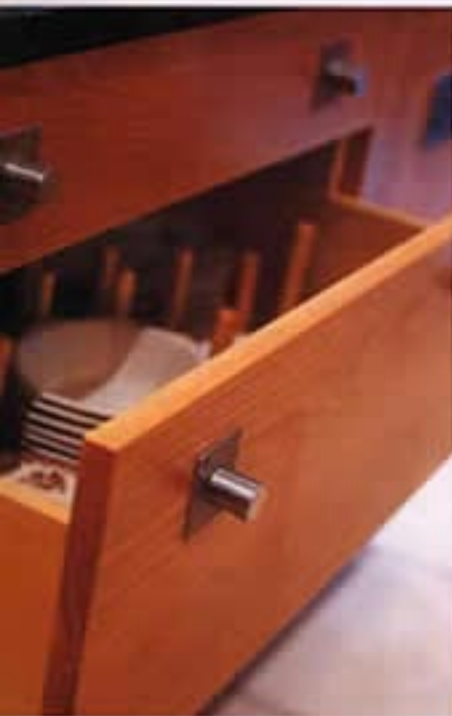
above Deep drawers with neat peg dividers keep plates and crockery in their place.