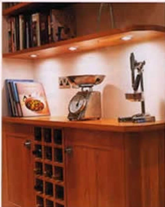
above Storage solutions have been created for every nook and cranny, including the built-in 18-bottle wine rack.