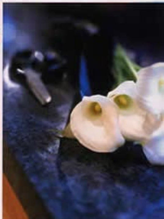
above Durable Steel Grey granite worktops are ideal for a hardworking family kitchen.